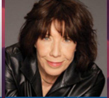
LILY TOMLIN (2013)