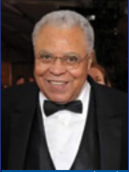
JAMES EARL JONES (2010)