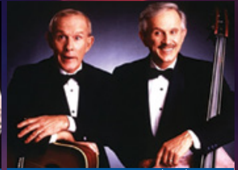
THE SMOTHERS BROTHERS (2009)