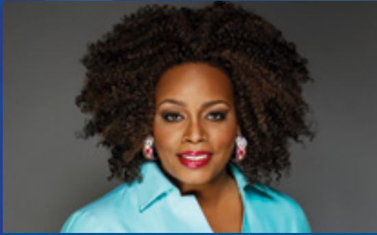
DIANE REEVES (2007)