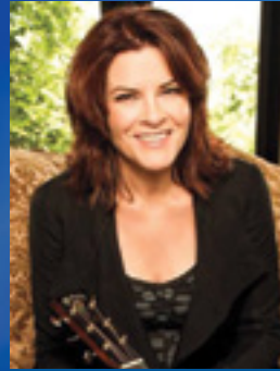
ROSANNE CASH (2015)