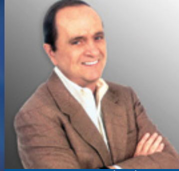
BOB NEWHART (2011)