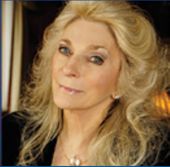
JUDY COLLINS (2014)