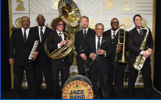
PRESERVATION JAZZ BAND (2011)