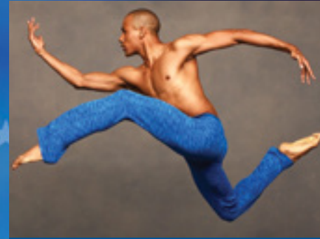
ALVIN AILEY II (2015)