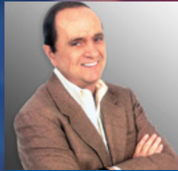
BOB NEWHART (2011)