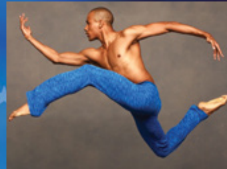
ALVIN AILEY II (2015)