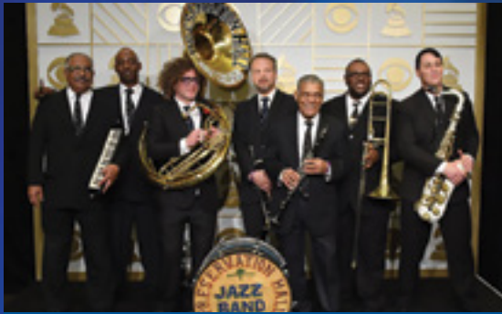
PRESERVATION JAZZ BAND (2011)