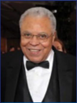
JAMES EARL JONES (2010)