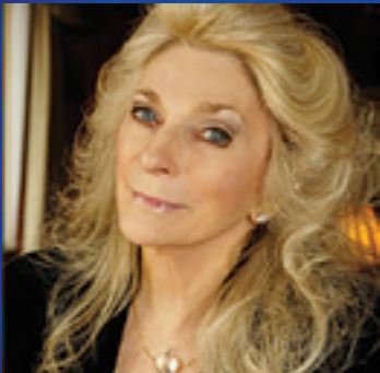
JUDY COLLINS (2014)