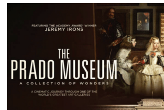
The Prado Museum: A Collection of Wonders Monday, January 20, 2020