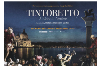
Tintoretto: A Rebel in Venice Monday, November 4

Experience the lives and works of great art masters in this spectacular HD documentary series akin to National Geographic travelogues. Filmed on location where the artists lived and painted, the documentaries feature insights from art experts and historians.