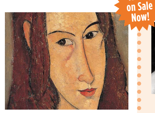
Maverick Modigliani Monday, February 28