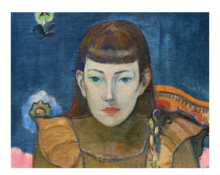
The Danish Collector Monday, February 7

Mondays, 12 pm and 7 pm Tickets: $18 Join the Majestic for in-depth documentary voyages into the art and lives of the most extraordinary art masters of their time.